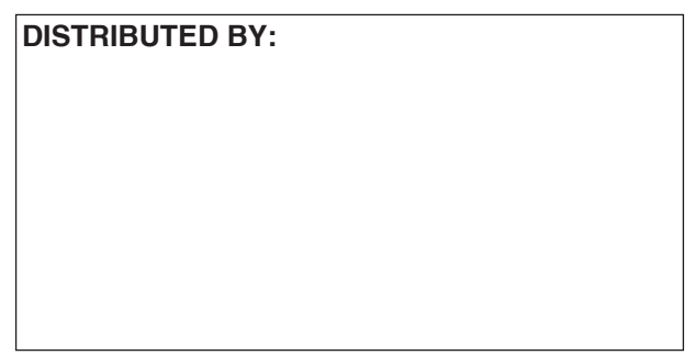
© 2015 by Kohler Co. All rights reserved.

Availability is subject to change without notice. The generator set manufacturer reserves the right to change the design or specifications without notice and without any obligation or liability whatsoever